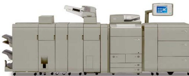
Colour imageRUNNER ADVANCE C9000 PRO Series

Whatever the scope of each production project, the imageRUNNER ADVANCE Light Production range deliver quality levels that set them apart. Incorporating a wealth of image quality know-how, every job is produced with vibrant, consistent colours or the crispest black and white text and smoothest half-tones. Diverse media handling capabilities and high-end finishing options – such as booklet making, professional punching and advanced folding capabilities – ensure prints exceed every expectation.