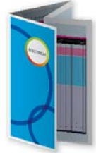
Double parallel Fold