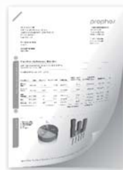
Stapling and Hole Punching