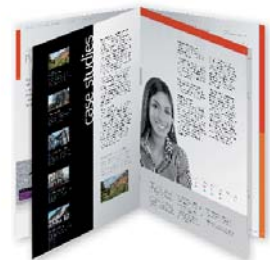
Saddle Stitching and Trimming