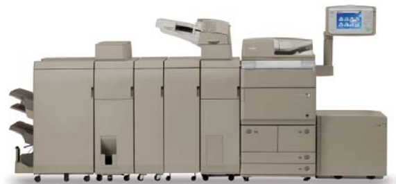
Black and white imageRUNNER ADVANCE 8000 PRO Series