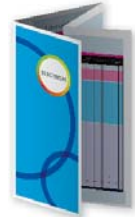
Double parallel Fold